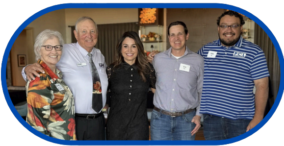
PCL Contract Bonding Agency 972.459.4749 www.pclbonds.com

Our focus on surety bonds allows us to stay informed on construction issues and provide services that are highly tailored to the needs of contractors.